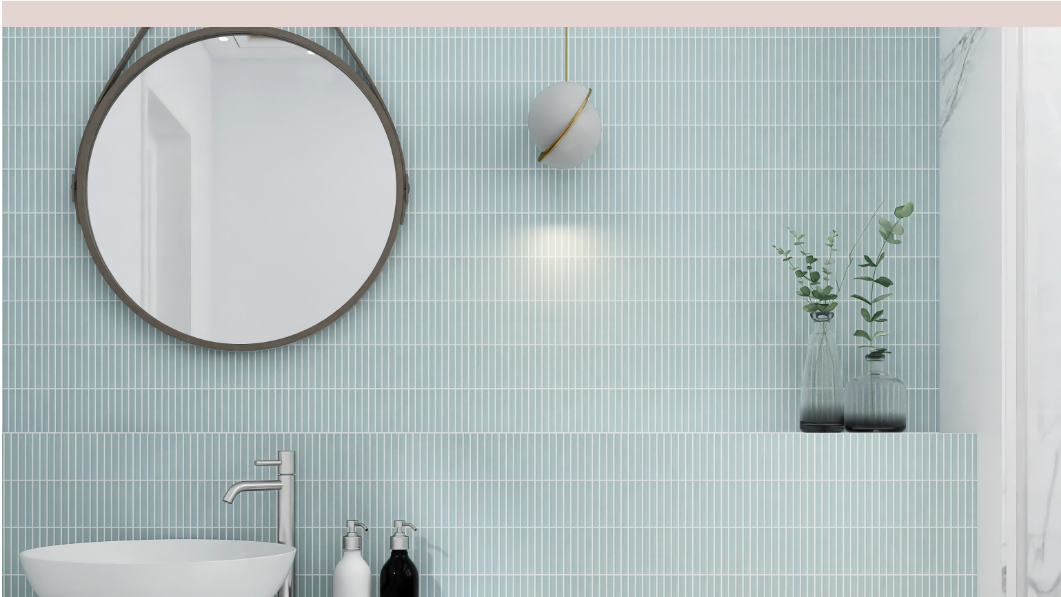
11X12 STACKED MOSAICS