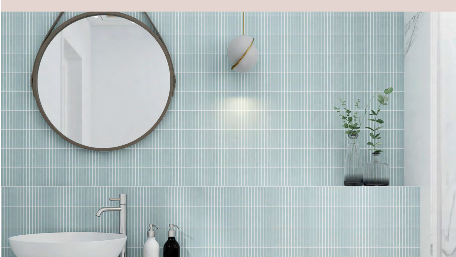
11X12 STACKED MOSAICS