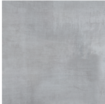
DARK PEWTER UMODAPETIV3030M