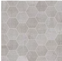
DARK PEWTER UMODAPETIVHEXM